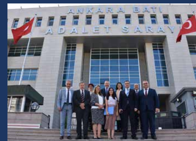
Pilot Courthouse visit - Ankara West Courthouse: Increasing Efficiency of Auxiliary Staff in Judicial Services and the Quality of Trainings