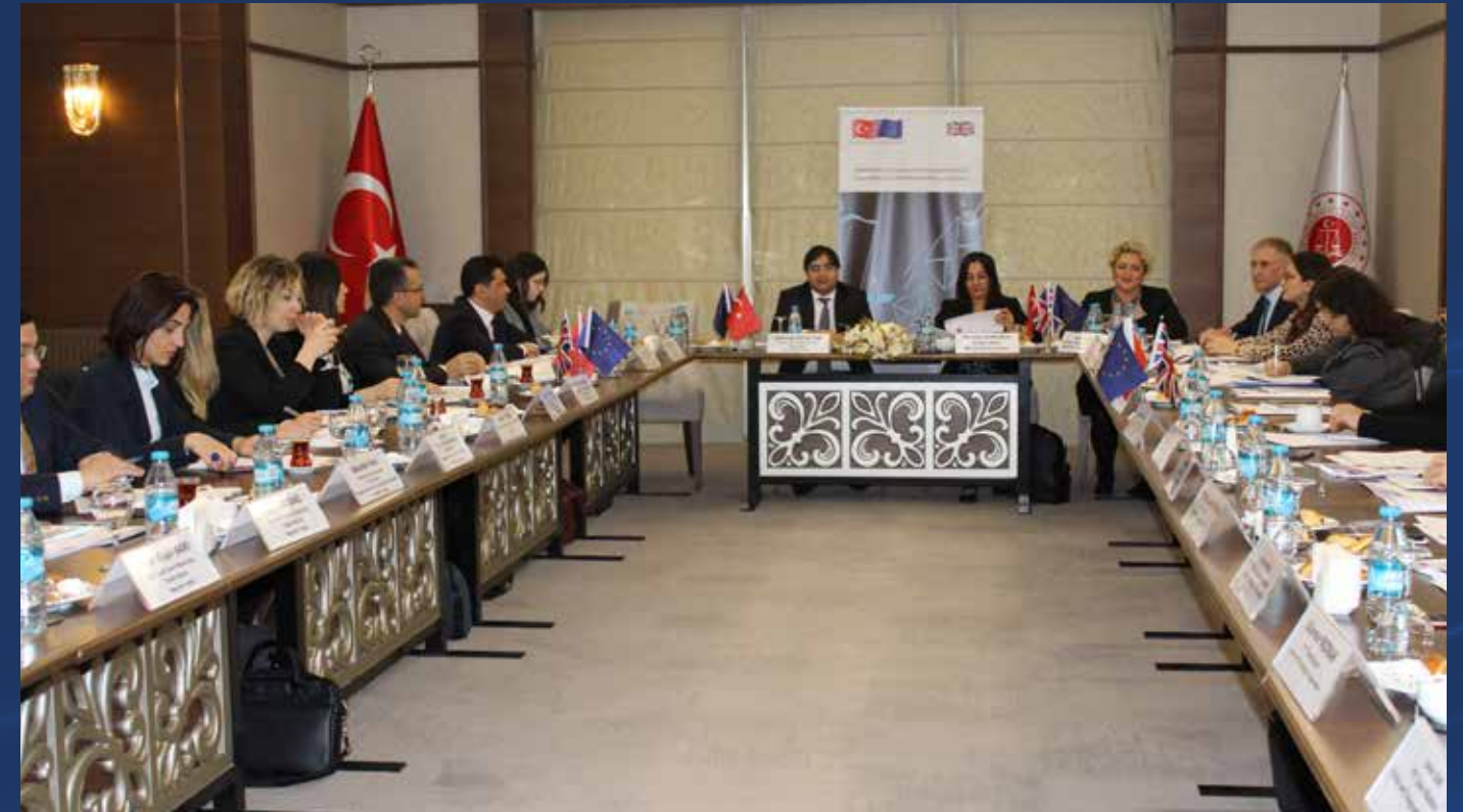
Third Steering Committee Meeting for the Judicial Notifications Project in Turkey