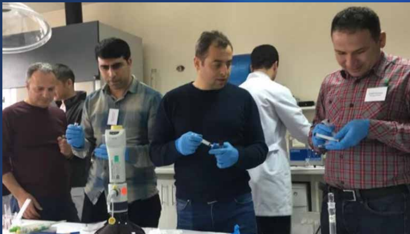
Training Delivery for the Forensic Drugs Project in Turkey