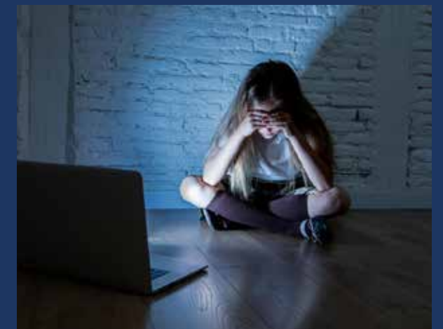
Co-ordinated and consistent approach must be developed to effectively respond to the threat of child abuse and exploitation