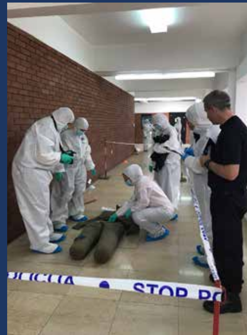
DVI training in Croatia