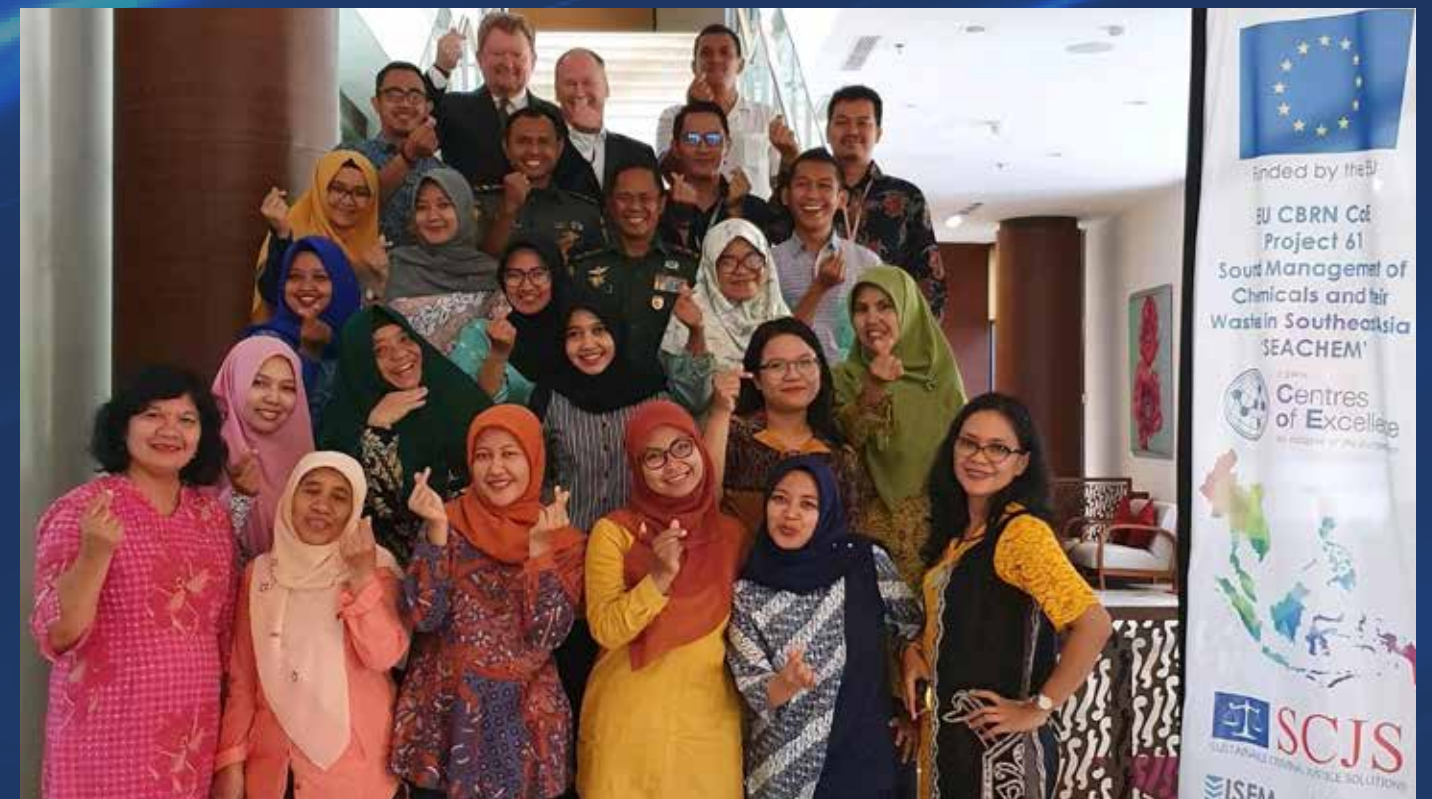
Project 61 delivery in Cambodia