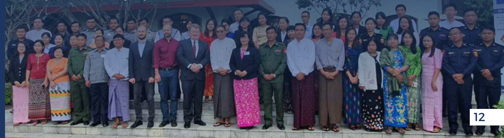
Project 61 National Training in Myanmar