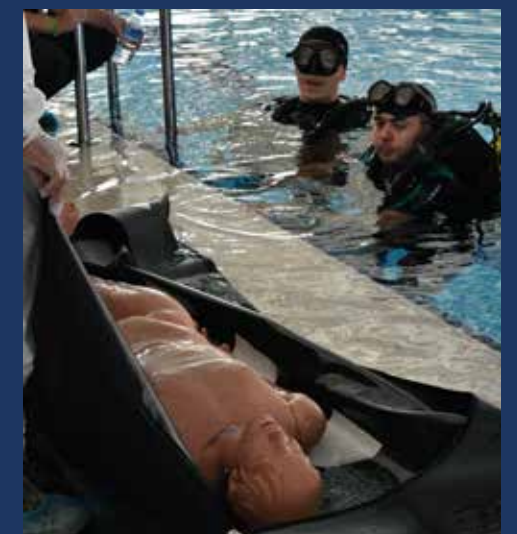
Body recovery training