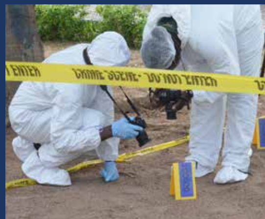
CSI Training delivered to the Nigeria Air Force