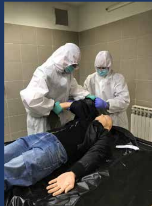
Mortuary processes following body recovery