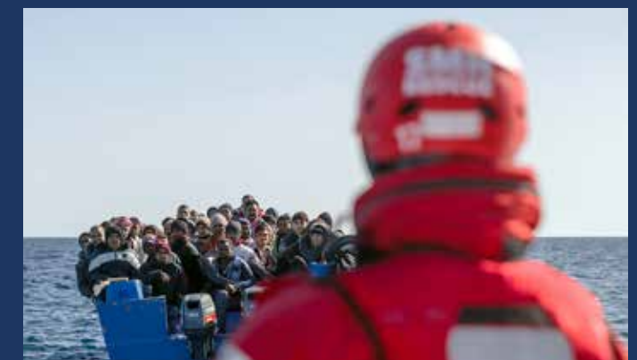
The smuggling of migrants is an increasing phenomenon exploited by organised criminals