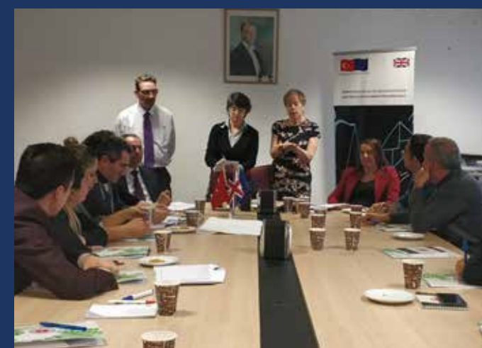
SCJS conducting a Training Needs Analysis as part of the Judicial Notifications Project in Ankara, Turkey