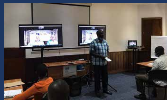
Financial investigation training in Kenya delivered through Virtual learning Platform during the COVID-19 Pandemic