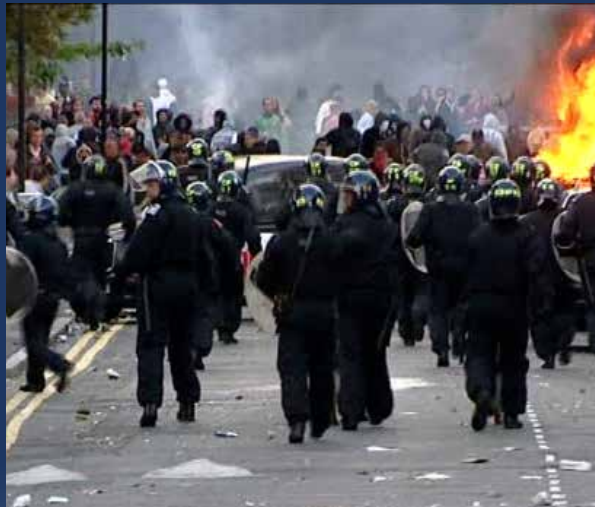
Crowd control measures in public environments