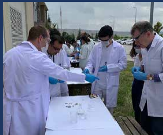
Police Drug Profiling Training Delivery in Turkey