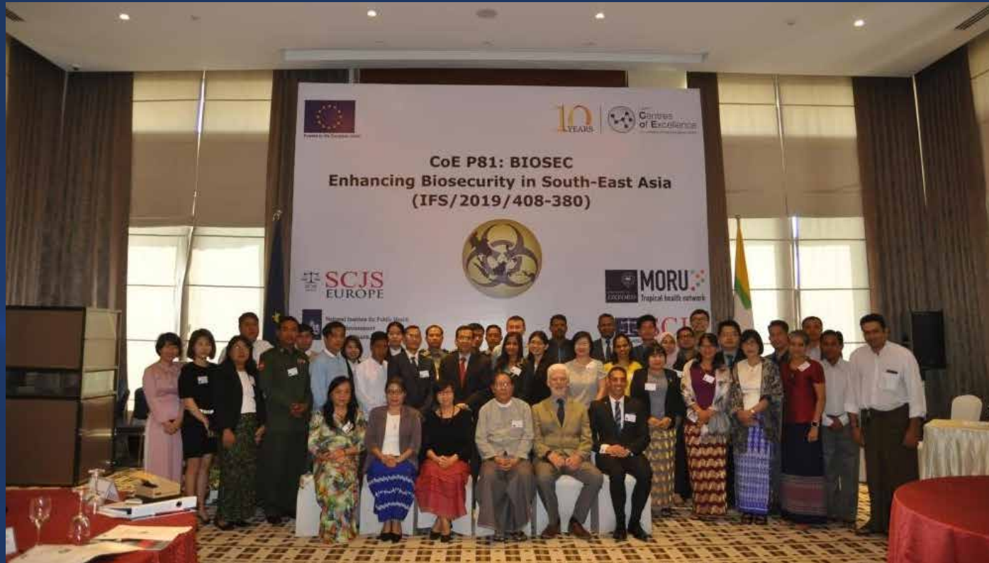
Project 81 CoE ASEAN Conference in Malaysia