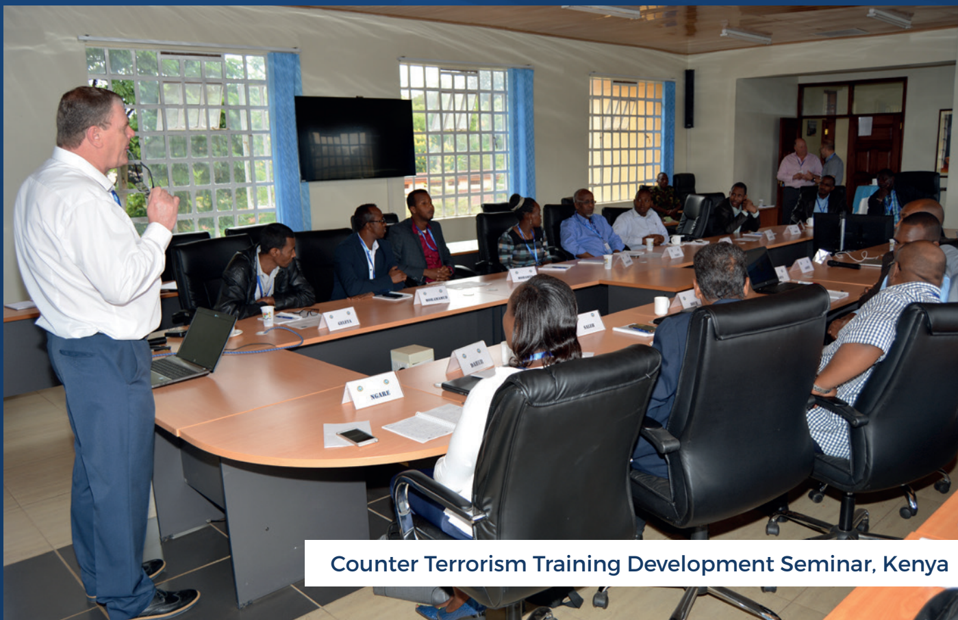
Counter Terrorism Training Development Seminar, Kenya