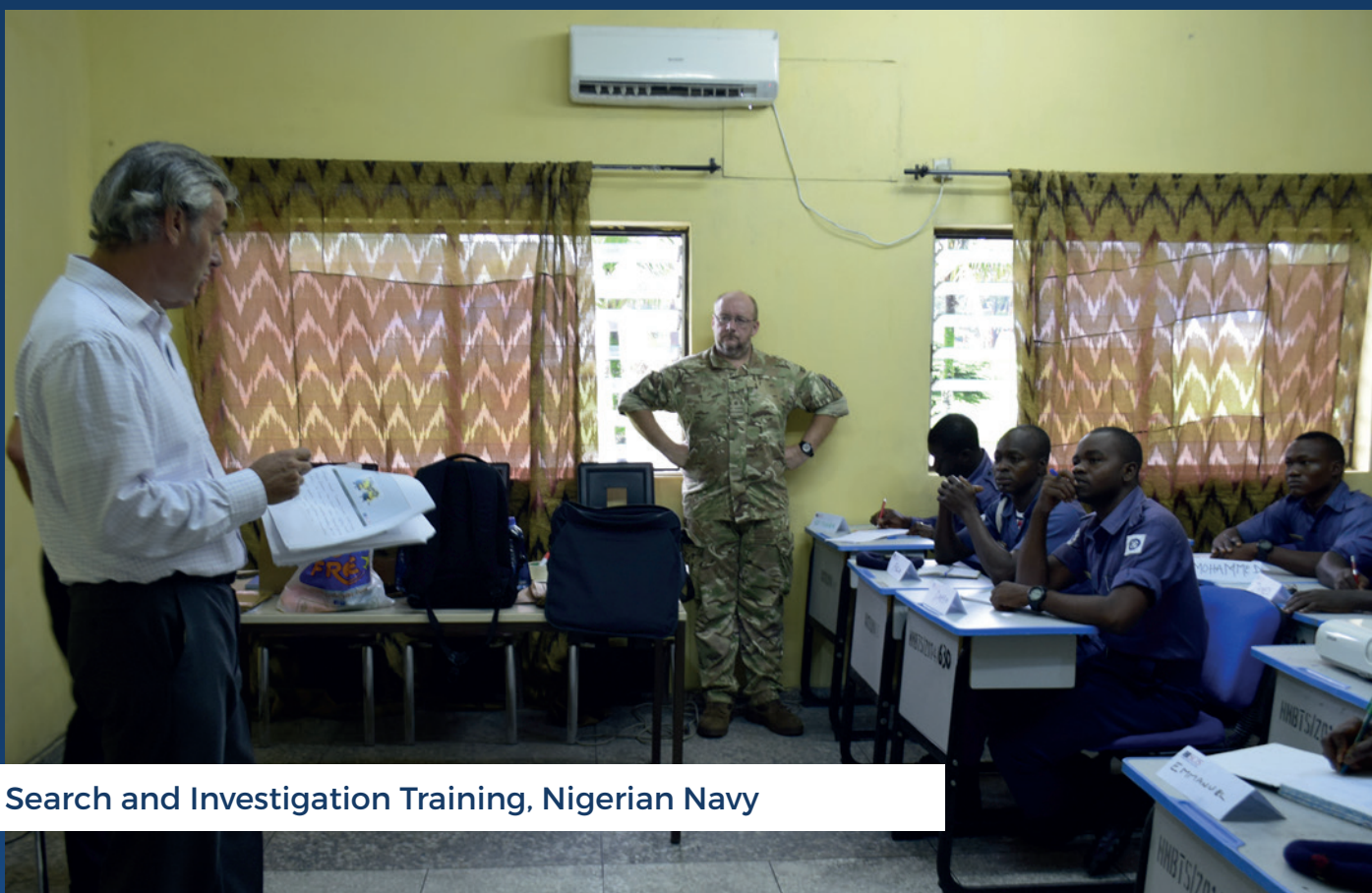
Search and Investigation Training, Nigerian Navy