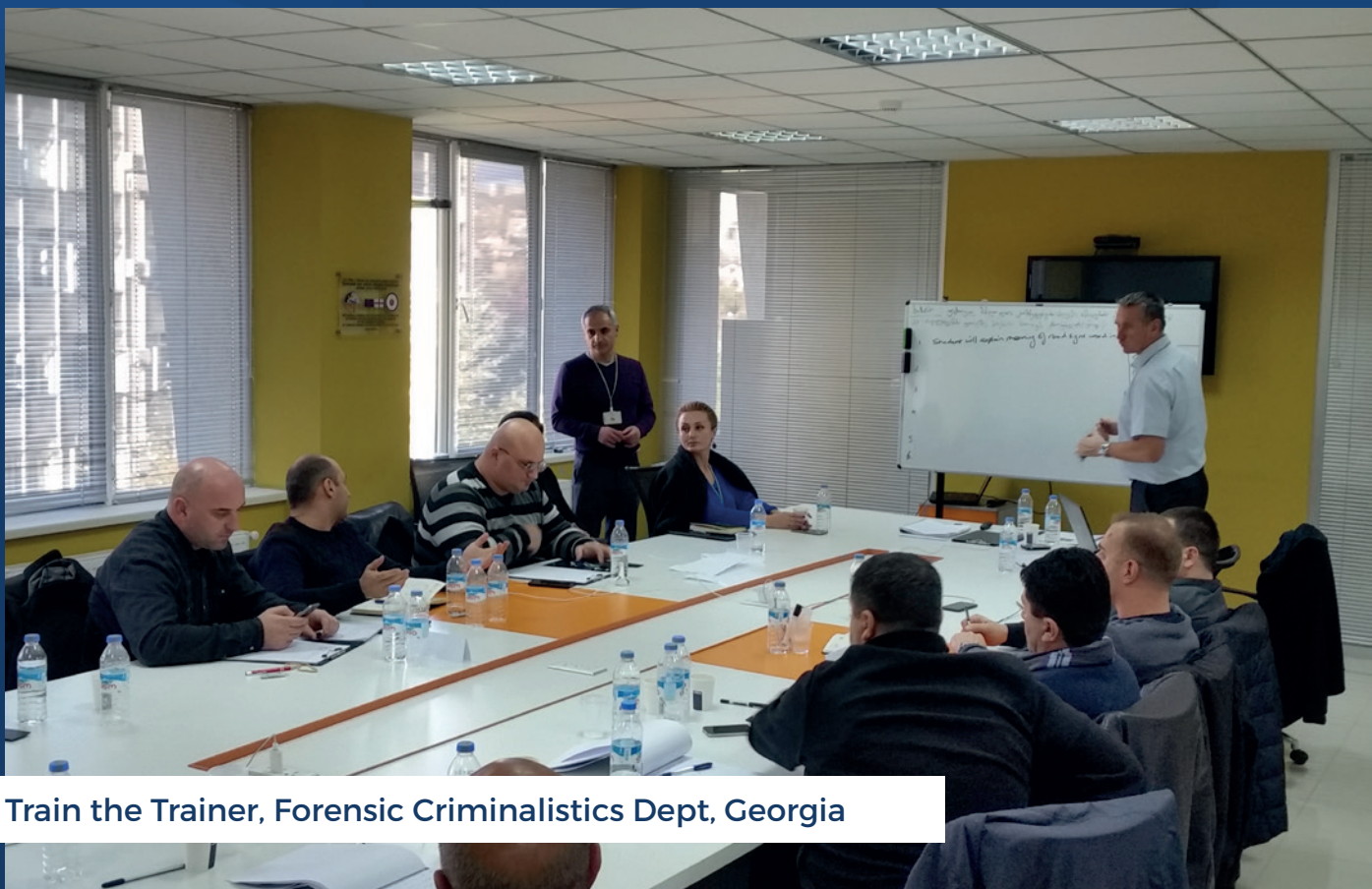
Train the Trainer, Forensic Criminalistics Dept, Georgia