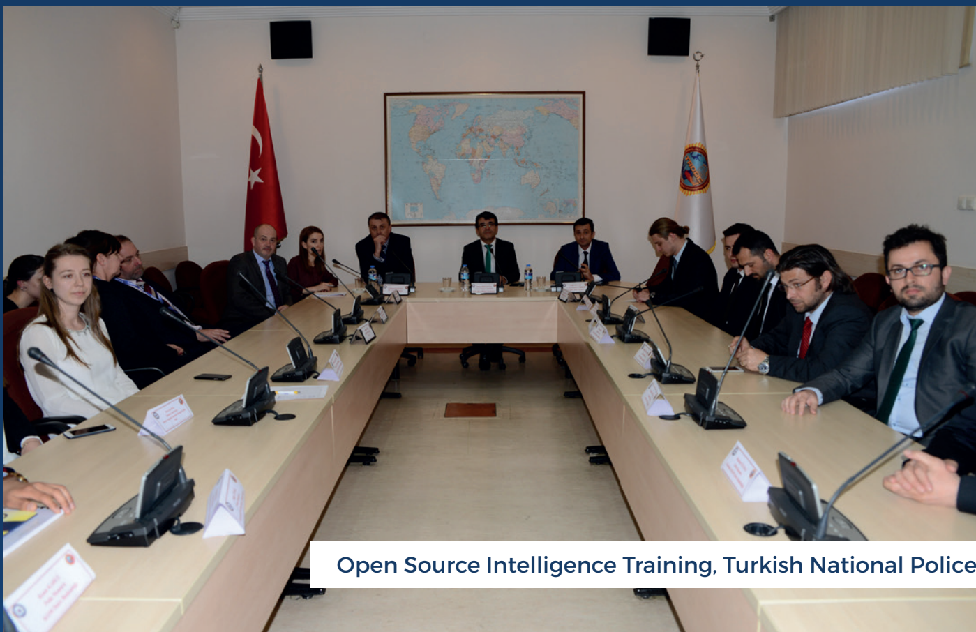
Open Source Intelligence Training, Turkish National Police